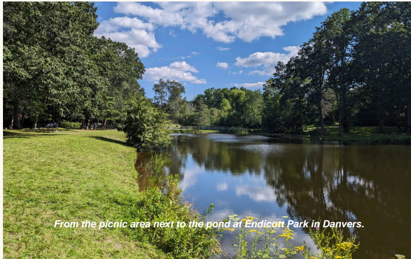
From the picnic area next to the pond at Endicott Park in Danvers.

Few places appear more often on local parents' recommendation lists. Animals, playgrounds, trails, fields, and community events make it a regular part of childhood for many North Shore children.